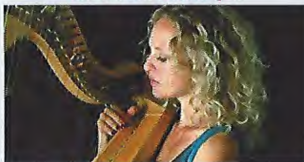
Yes, harpists: we confess - we reversed the cover picture for design reasons.

Sat 9 February 2019 Tonbridge Parish Church 7.30pm